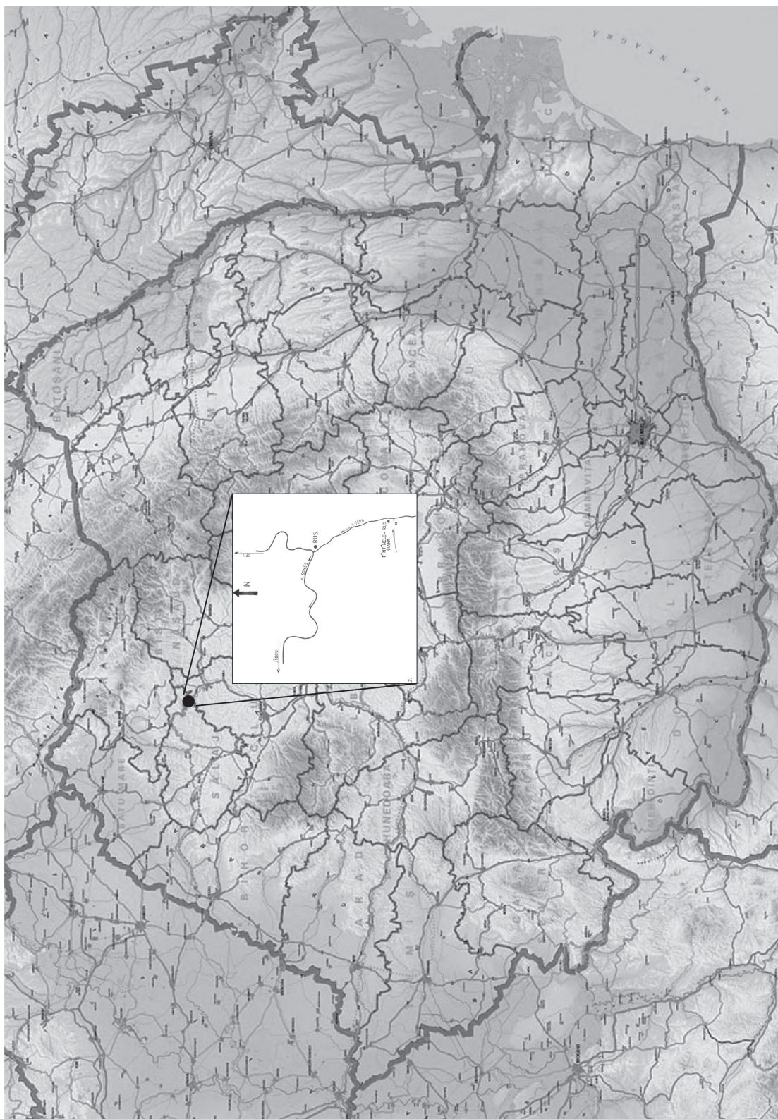
Plate I. 1. Position of Fântânele-Rus locality on Sălaj County map. 2. Discovery site (X) of the bronze hoard of Fântânele-Rus.