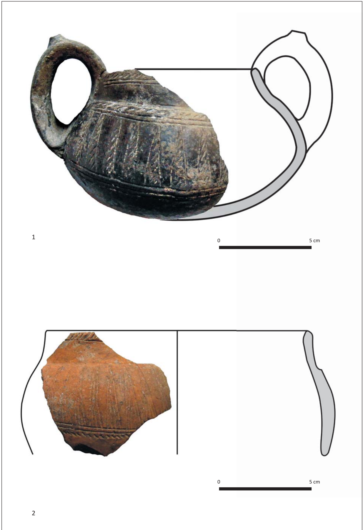
Pl. III. 1. Fragmented cup discovered at Hunedoara-Dealul Sânpetru ( Stația de Filtrare ); 2. Fragmented vessel (cup/bowl?) discovered at Hunedoara- Str. Toamnei